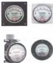
Flush, Surface or Pipe Mounted

Note: May be used with hydrogen. Order a Buna-N diaphragm. Pressures must be less than 35 psi.